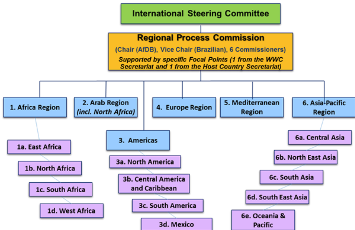
Figure 2: Proposed Regional and sub-Regional Arrangements of the Regional Process (updated)

The structure of the Regional Process of the 8 th World Water Forum will be primarily based on six larger geographic areas, or Regions, and in some cases, where appropriate, and up to the decision of the Regional Design Groups, these six Regions will be divided into sub-Regions. It is foreseen that Africa, the Americas and Asia-Pacific will split in such a manner with the Arab Region, Europe and Mediterranean staying as one unit.