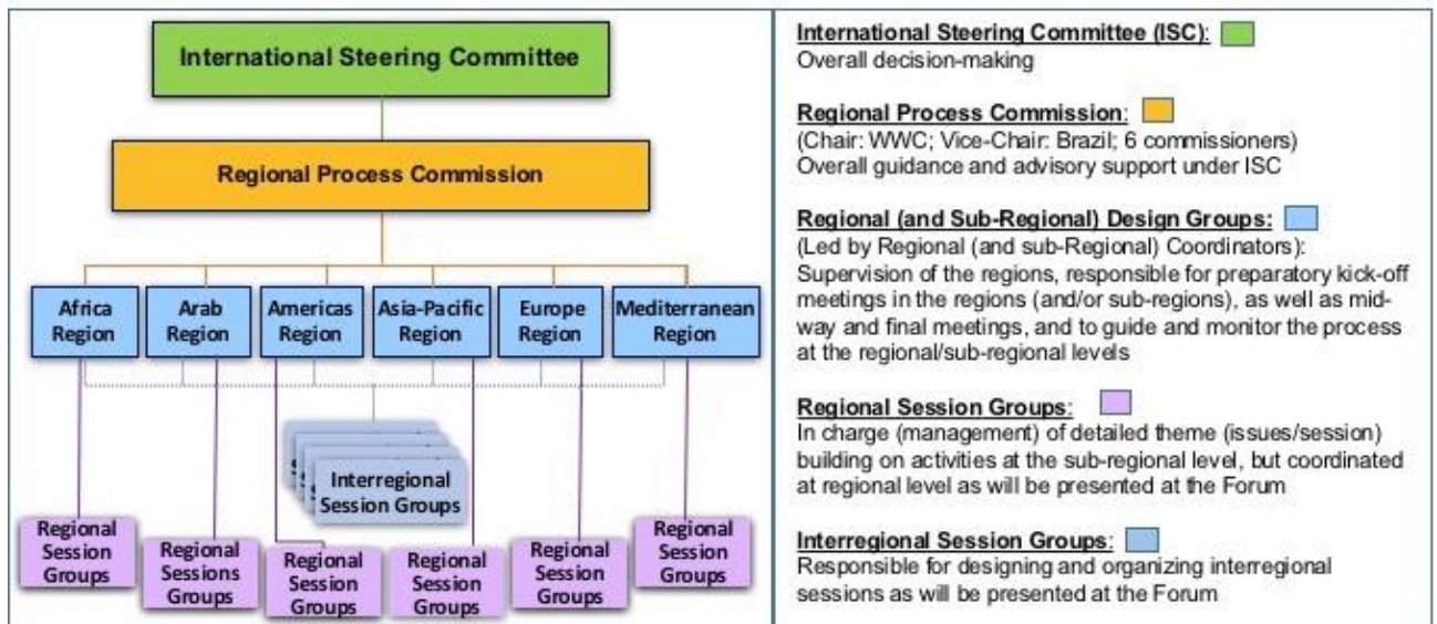
Figure 1: Organizational Structure of the Regional Process

Under the purview of the RPC is the overall coordination of the Regional Process. To assist them at the regional level, Regional Coordinators are responsible for guiding and coordinating the work of the Regional Design Groups (RDGs), multi-stakeholder bodies that implement the proposed roadmaps of their respective regions. The Regional Design Groups will, in turn, construct the Regional Session Groups, which are tasked with organizing individual sessions at the 8 th World Water Forum itself. These Session Groups will be comprised of stakeholders from both within the RDGs as well as outside. Similar groups, known as Interregional Session Groups, will be developed in order to organize the Interregional Sessions at the Forum.